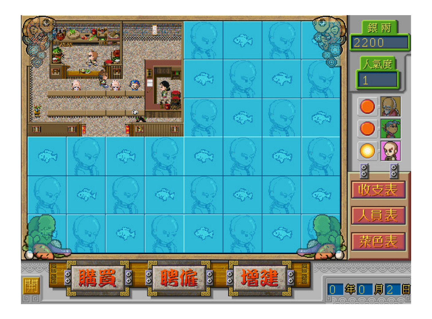
RPG Maker MV - Inspirational Vol. 2 Download Utorrent Windows 10

Download ->>> <a href="http://bit.ly/2JWBhL8">http://bit.ly/2JWBhL8</a>